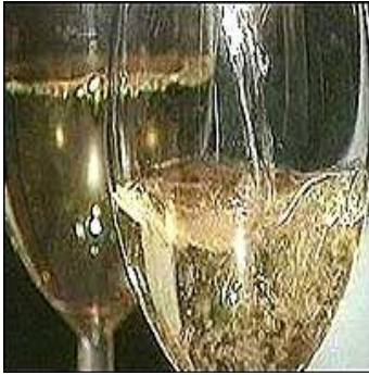
Senior female executives are drinking more than male colleagues