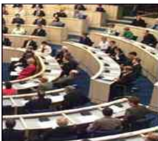
Paper released in August

the website will see HI-Net opening out to include partner organisations in Grampian such as the Local Authorities, NHS Grampian, Voluntary Sector, Aberdeen University and RGU and any other in interested organisations or individuals with a remit for Health improvement.